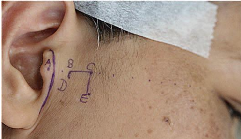
SCHEMA : Clinical protocol for PRP injection (9)