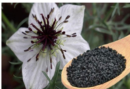
Figure 1 Jintan Hitam ( Nigella sativa )[11]

This plant is about 20-60 cm tall, short-lived, linear leaves grayish green, thin like threads. The seeds are rather hard, double pyramid with both ends tapered, one pyramid shorter than the other, angled 3 to 4, 1.5 mm to 2 mm long, 1 mm wide outer surface brownish black, black gray to black, mottled, rough, wrinkled, sometimes with multiple longitudinal or transverse ribs. In the cross-section of the seeds, the seed coat is blackish brown to black in color, the endosperm is reddish yellow, gray, or blackish gray. It has a very pungent odor, and contains about 21% protein, 35% carbohydrates and 35-38% plant fats and oils[11].