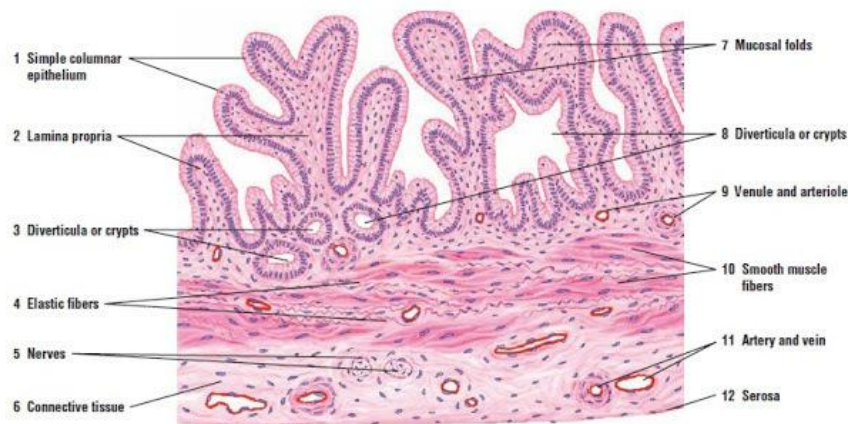
FIGURE 14.9 ■ Wall of gallbladder. Stain: hematoxylin and eosin. Low magnification.

The mucosal folds, called rugae, disappear as the stomach expands. The stomach also has a gastric foveola, the superficial one in the fundus, and the deepest in the pylorus. The stomach is part of the digestive tract similar to a pocket. The resting state of the adult stomach volume is 50 ml, but when it contains food, it can accommodate about 1,500 ml[13]. The intraluminal pressure is relatively constant due to the influence of the hormone Ghrelin, which stimulates hunger and causes smooth muscle relaxation of the external muscles. Bolus (chyme) of food from the esophagus to the stomach and gradually to the duodenum through the pyloric valve in liquid form, which is assisted by stomach acid and various enzymes, namely Pepsin, Renin, Lipase, and paracrine hormones[14].