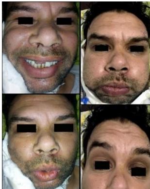
FIG5. Photographs showing postoperative facial nerve testing immediately after surgery.