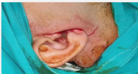
FIG 1. photograph showing lazy (s) incision for the transmassetricanteroparotid approach