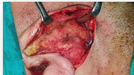
FIG 2. photograph showing the intact parotid gland capsule after incision