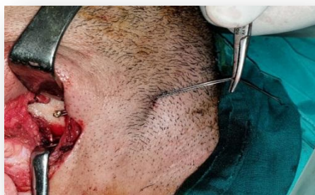
FIG 3. photograph showing the screw-wire system held with a wire twister then used to deliver traction to the distal segment of the fracture.