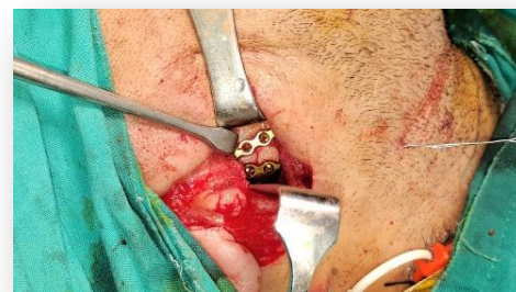
FIG 4. photograph showing fixation of the Condylarfracture using titanium mini plates and screws aided by the screw and wire system.